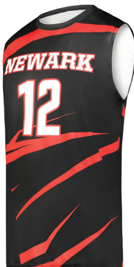
Cut Shot II