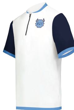
All Over 2.0