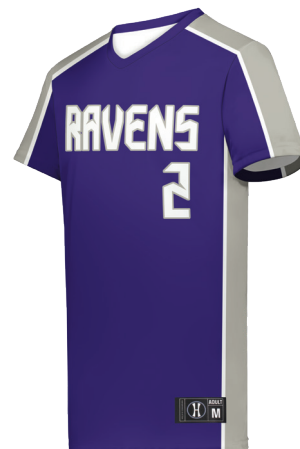
Classic Color Block