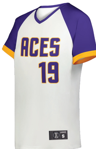
All Over 2.0