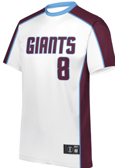
Classic Color Block