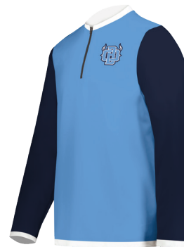
All Over 2.0