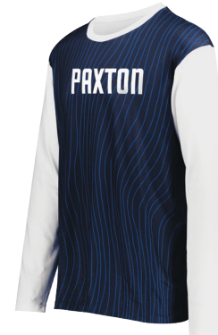
Wavy Vertical Stripe